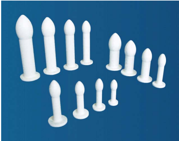
Vaginal Dilator Sets, Model: Family A -Large, Family B -Medium. Familv C-Small